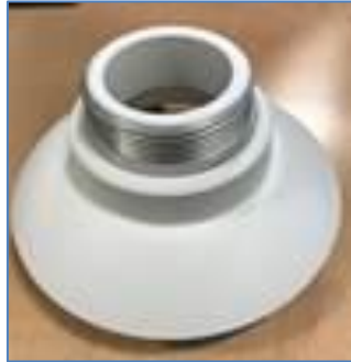
Figure 1. NPT Pendant Cap

The pendant cap comes with the outdoor model of the camera, but needs to be ordered separately for the indoor model of the camera.